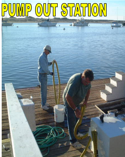
PUMP OUT STATION