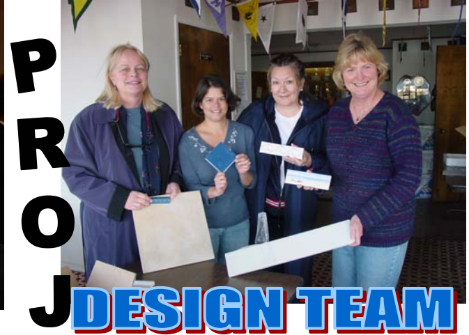
P R O J E C T S DESIGN TEAM