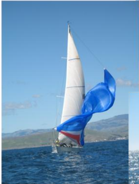
Whizbang putting a new "TWIST" on spinnaker techniques