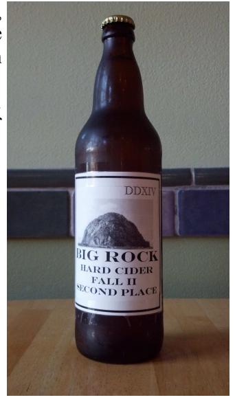
Dave's Big Rock Hard Cider