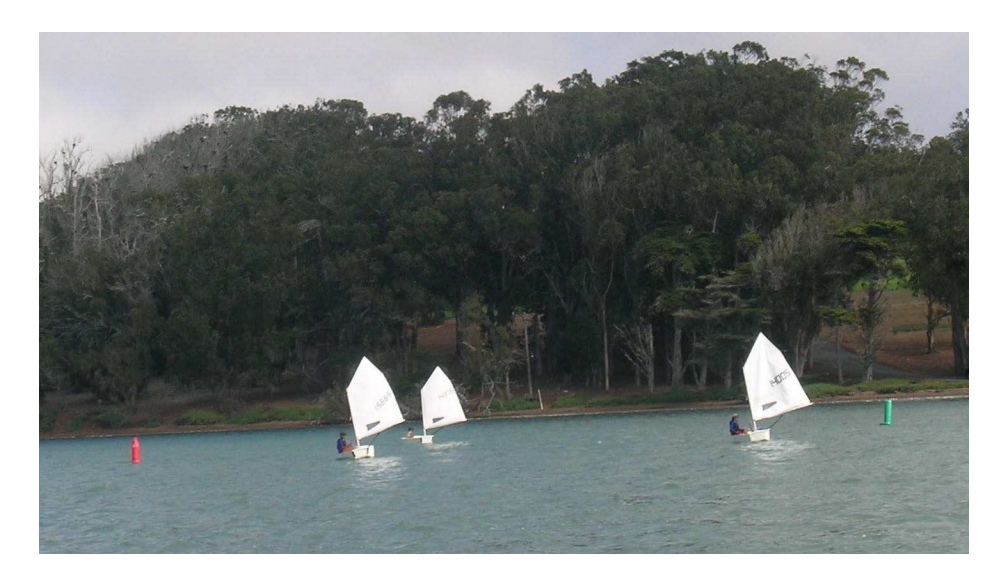
Red Right Returning

October Leaves - The Junior Yacht club had two beautiful days on the bay in October. Most of the Optis and several lasers were out each day. The weather was the central coast's best, with sun protection more important than warm clothes. The new members fresh from summer sailing continued to work on points of sail, trim, and maneuvering. A typical juniors day begins with the junior sailors arriving around 9:30 AM and rigging their boats. Next there is a session on some point of rigging, seamanship, or boat handling. For example coach McClish might bring out the "Land Opti" and run everyone through tacking drills. After this on deck work, the group inspects boats, and then heads out onto the bay. During the last session of October the Optis made a grand tour of the bay. This started with a long reach/run to the state park marina (during which the importance of channel markers was illustrated). After lunch on the beach opposite docks, there was a challenging upwind sail out of the narrow marina. This was an excellent confidence builder for the newest members. Back on the deck by 2:00 boats are de-rigged, and those stalwarts who can't stay dry take a hop into the bay.