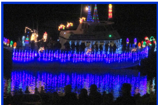
Dec 5th Lighted Boat Parade