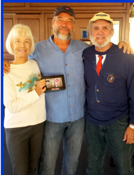
Commodore's Cup: 2nd Place the Salas on their Lido