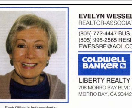
Each Office Is Independently Owned And Operated.

Contact the NATIONAL FOREST SERVICE: (877) 444-6777 or www.reserveamerica.com/reserve