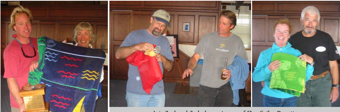
1 st, 2nd and 3rd place winners of Day Sailer Regatta

(The results for the Fall series were posted in time to get them into this issue — see next page.) — Dot Rygh