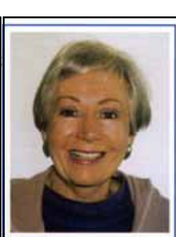
Each Office Is Independent Owned And Operated.

1212 Marsh Street San Luis Obispo, CA 93401