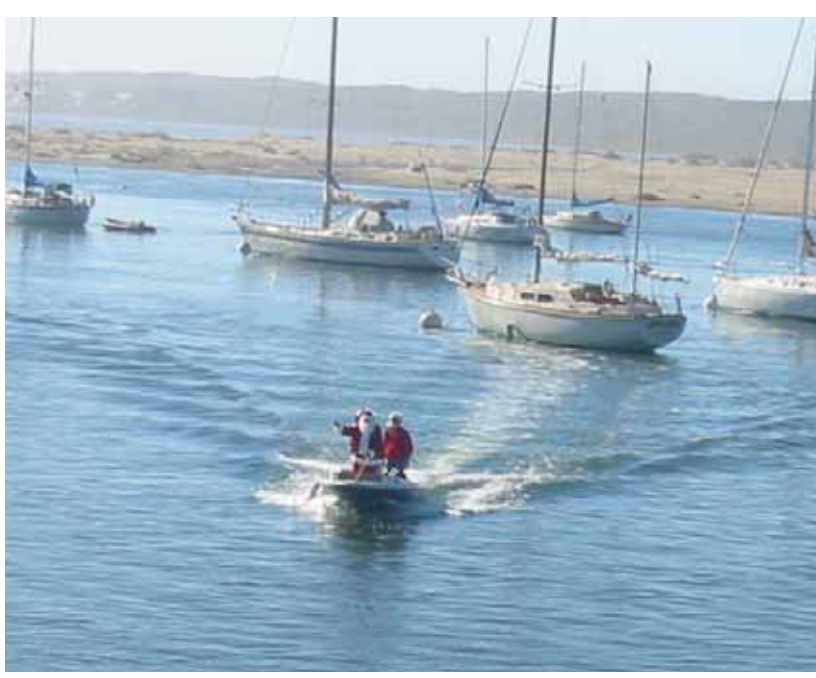
Saturday December 11, 2004. It was a very successful party, even if Santa had to make a U-turn and come back to the club. Everyone had a great time. Santa didn't miss anyone and had gifts for all.