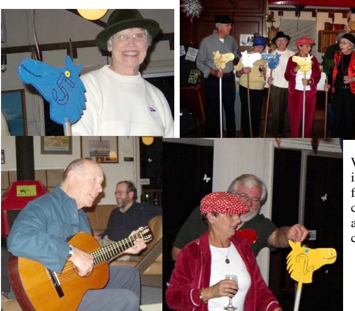
Who was it that fired the canon off at the club????