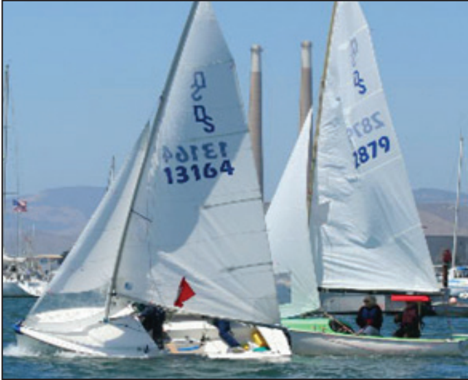
The lead boat in a race at the Day Sailer Invitational