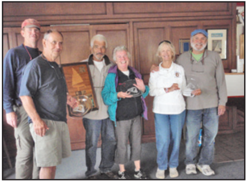
Saturday, August 6 of the Lido fleet championship participants