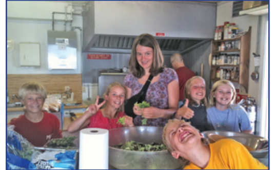
Juniors hosting hamburger night.