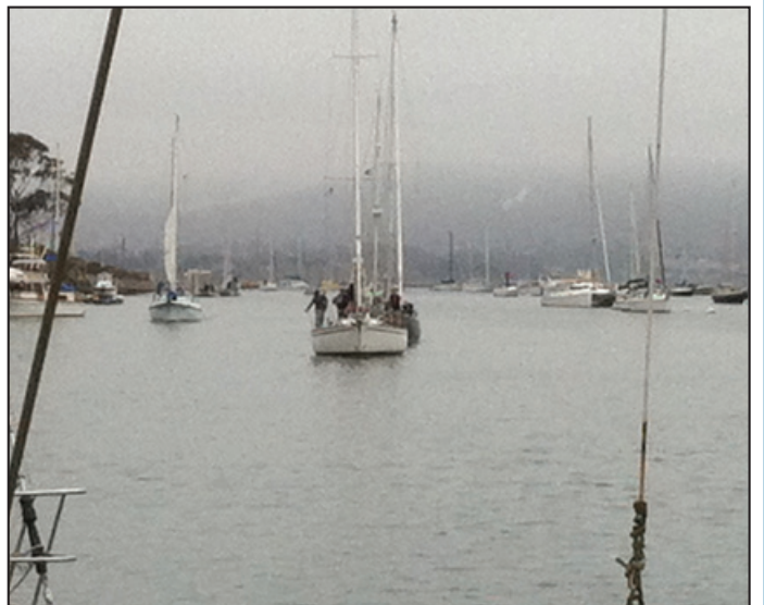
The fleet heading out for the Zongo Cup