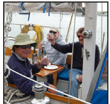
After the race