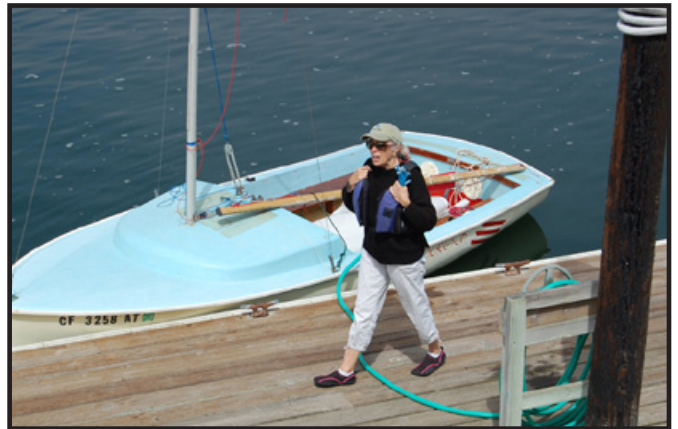
The Shenanigans started early with a hose in a boat.