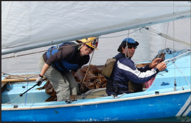
Got my seaweed and I'm ready for the Shenanigans Race