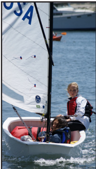
Two juniors in a one man Opti