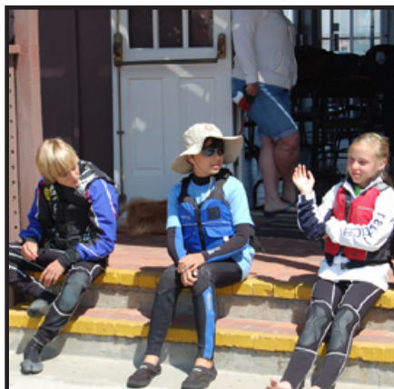
Opti racers in Jack Johnson