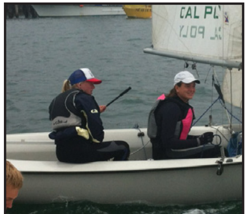
Laser chicks on an FJ