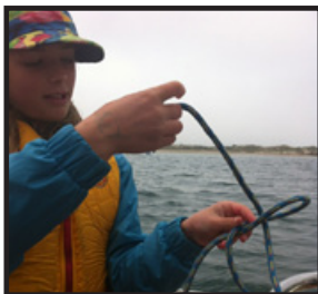
"The rabbit comes up the hole..."