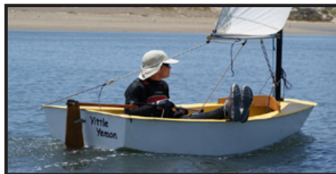
Big junior in a small boat