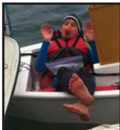
Bobbing with apples