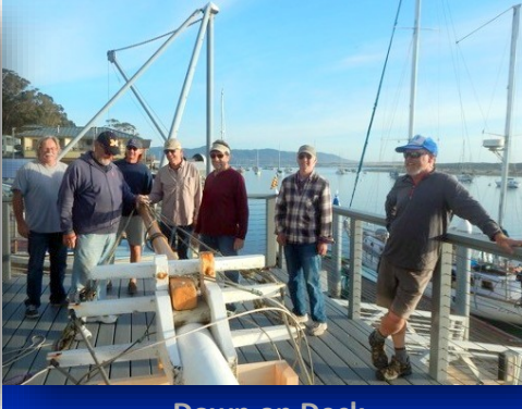
Down on Deck