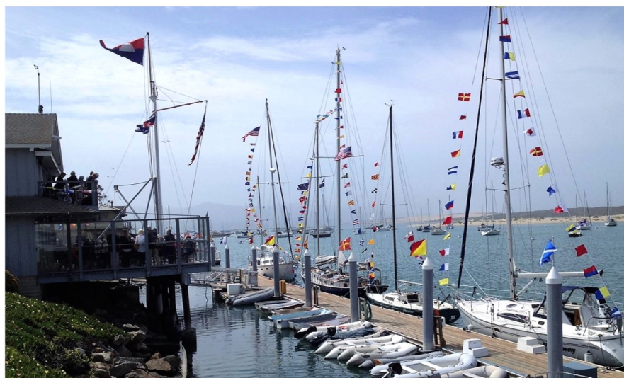
2018 Opening Day!

mbyc.comm@gmail.com if you would like to help out.