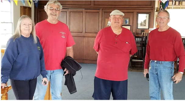
Furniture moving crew