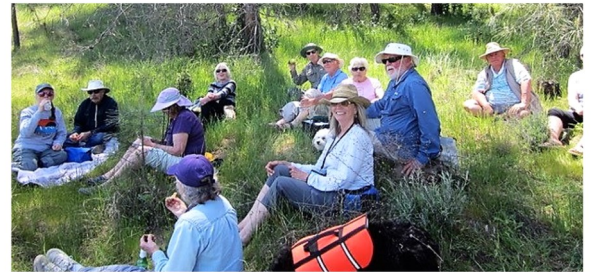
Lunch break at Santa Margarita Lake