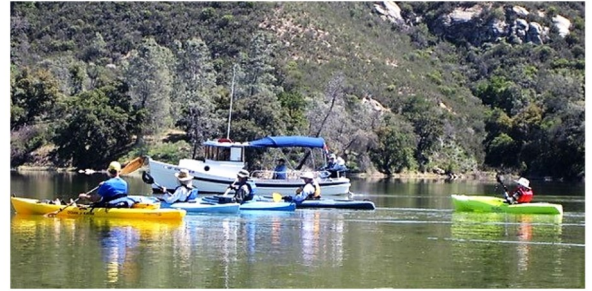
Santa Margarita Fun Float

Everyone on any kind of floating boat or board is welcome.