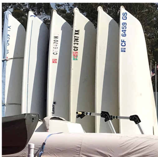
Look at all the new Lasers in the yard!