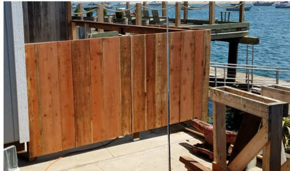
New storage area