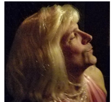
Anyone recognize this gal?

Thank all of you who put in the work to keep the club looking good and make it such a fun place.