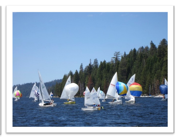
Daysailers rounding 1 with opti's