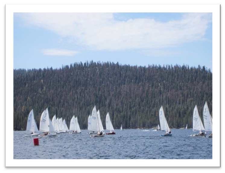
Daysailer Start at Huntington Lake High Sierra Regatta