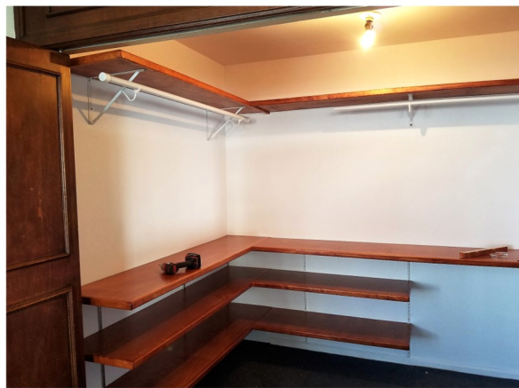
Remodeled Ship's Store coming soon!