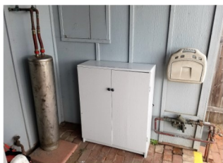
Lost and found cabinet is outside now