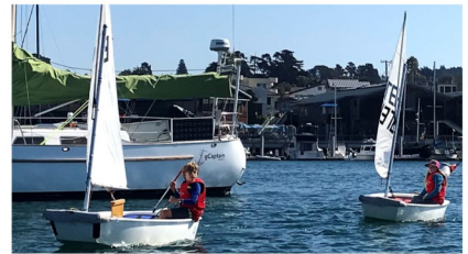
Green fleet Optimist sailors racing with their MBYC red vests