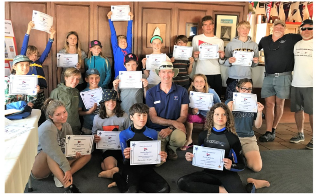
The sailors and coaches for the 2018 Chris Lockwood MBYC Junior Regatta

Junior Sailing will meet for the last sailing day of the year on November 11. Hope to see you at the bay!