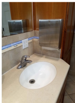
Woman's bathroom new tile around towel dispenser