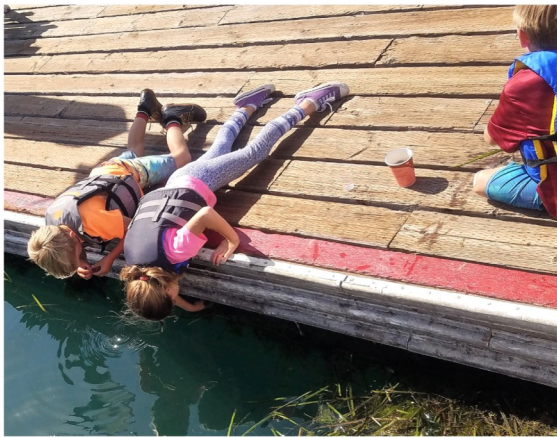
Kids enjoying a beautiful day at the club