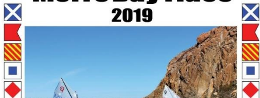
Morro Bay Youth Sailing Foundation www.mbysf.org