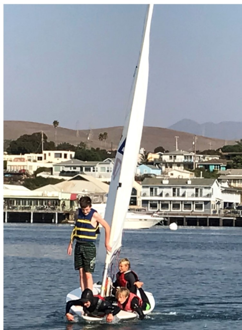
How many juniors does it take to sail a Laser? Four! One to steer, two to paddle, and one to balance the boat. Yes, they did fall in.

Be sure to order your Morro Bay Tides calendar for 2019. It is only $20 and filled with