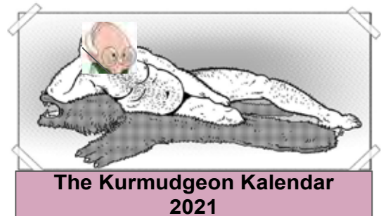
The Kurmudgeon Kalendar 2021

Regarding the progress of the Kurmudgeon Kalendar , we are currently looking for a bear skin rug of sufficient size to allow a Kurmudgeon to recline in a fetchingly reposed position. At this time his attire has not been decided, but whatever it is we're sure it will be quite appropriate.