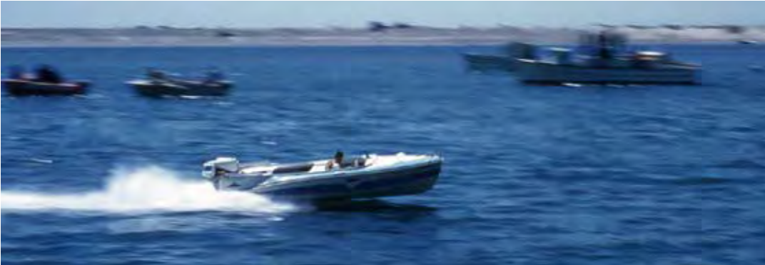
Racing in Morro Bay, 1960