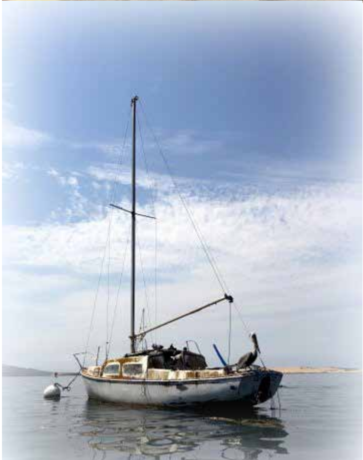
A floating pigeon coop shared with other waterfowl.