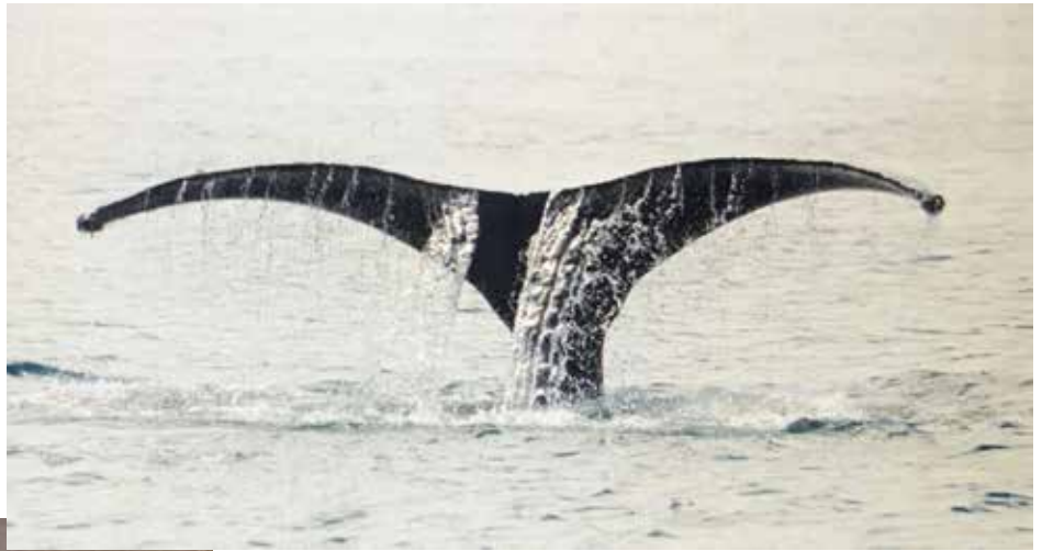
Unexpected 10th participant