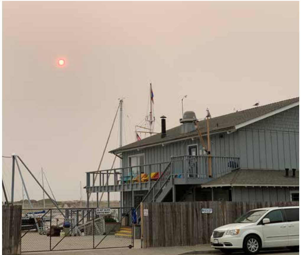
A red sun over the smoke covered Bay. August brought record heat and lots of the smoke from the many fires in California.

What is the second event? We plan to start work on a remodel of the upper deck of the clubhouse this month. With limited use of the club and support beams showing signs of rot it seems the best time to get this done. This will be a fairly large structural project. The challenge is this, the joists for the deck are also the joists for the second floor of the club house. The exposed ends are deteriorating and are in need of repair and protection. If the rot continues into the building we will have a major problem and expense. The solution recommended by several of our contractors is remove the old decking, repair the joists, then make the new deck with a waterproof product to keep water off the joists. We plan to do this with a hybrid approach using paid and volunteer labor to moderate the costs. There will be many opportunities to volunteer this fall I hope some of you can make one or many of our work days.