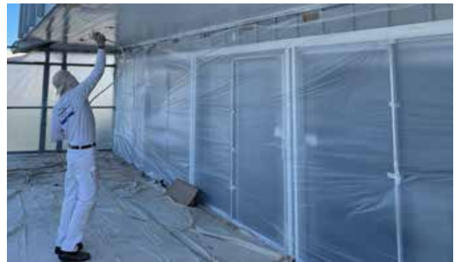
Tom Needham painting the lid on our new deck.