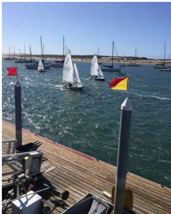
February 20th, First Bay Fleet Race for 2021! Success!