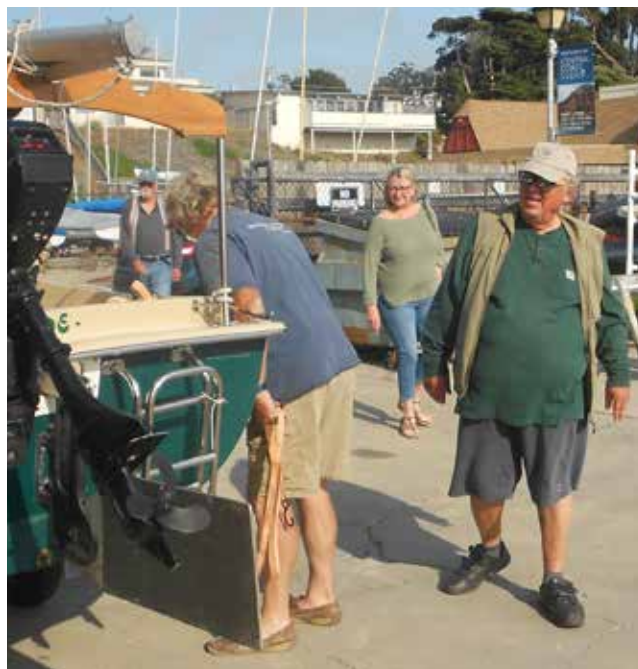
The Charlies cross paths