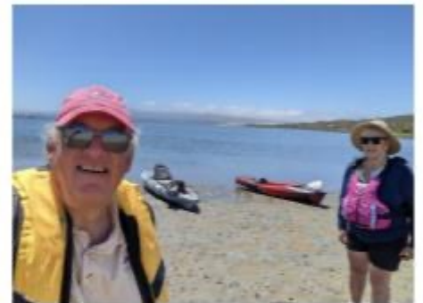
Small Float on a windy day.

FUNFLOATERS - We are hosting the August 25th hamburger night. Many hands make light work; it's a good thing we're not cooking broth. Please show up to help out. The theme for that hamburger night is Happy UnBirthday to celebrate everyone's birthday. Of course there will be cake and ice cream.