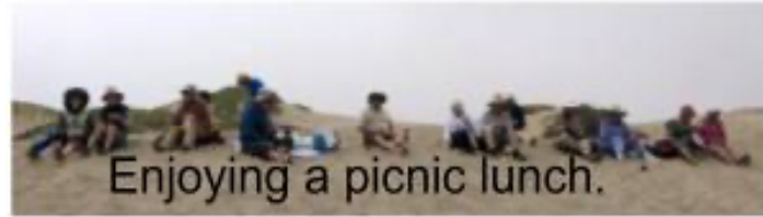
Enjoying a picnic lunch.

We had two Fun Floats in September, and both were very much enjoyed by those who attended. The weather for both Fun Floats was cloudy but very nice in terms of temperature and wind. On the 6th a large group of us paddled down the sandspit to have a picnic lunch. There were lots of shore birds and much to talk about. On the 26th we paddled down to BaySide to have lunch at the cafe. The paddle was