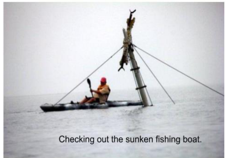
Checking out the sunken fishing boat.

We are planning a Halloween Party for October 31st. It will be held out on Sandal's Cove. Participants should plan on bringing a treat to share. The theme is "Halloween: A Pagan Holiday". Come in your Halloween costume. We will leave the dock at around 11:30.