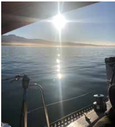
Jenkins overnighit race --Sunday sunrise and strong breeze