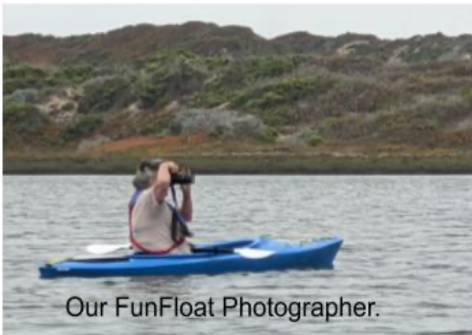
Our FunFloat Photographer.

We did explore the sunken fishing boat straight out from the launch ramp.