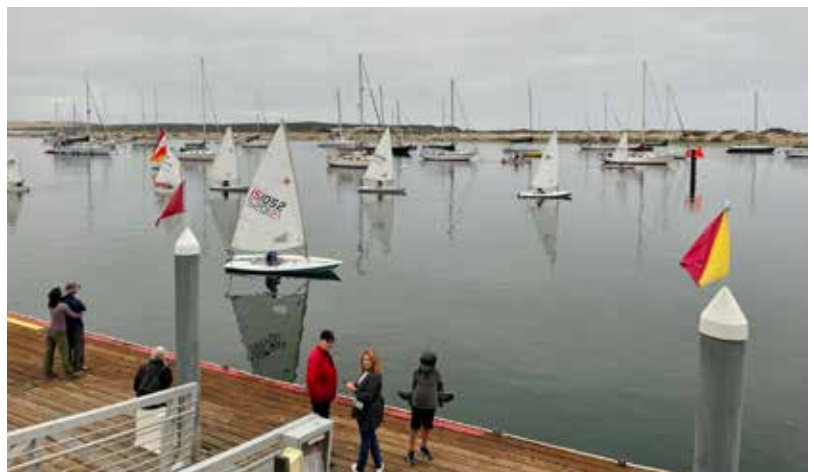
Chris Lockwood Junior Regatta, Sept. 26 had very light winds in the first race.