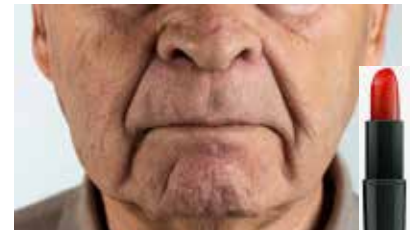
Anonymous, Disgruntled Gentleman Would-be Pageant Contestant

I'm sorry to inform you that there has been some friction between some of the Kurmudgeons . The Chaplain and The Member have signed onto the plan to fell the power plant stacks and use them to extend the breakwater. The Secretary and The Treasurer want the stacks to remain and to incorporate a rock climb on one, a rotating McDonald's with an included zip-line on the second one, and an internal bungee jump in the third. I hope to be able to arrange a truce between these factions by Christmas. As a public service, I invite the Yacht Club membership to weigh in on which option they feel would best serve the interests of the Club. Send me your comments to mbyc.alias49@gmail.com .