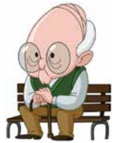
The Kurmudgeon Korner

I'm sorry to have to tell you this, but the First Annual MBYC Beauty Pageant has to be postponed. It was scheduled to take place right after the Kurmudgeon Klassic trophy presentation. Unfortunately, a number of male Yacht Club members were very put out that no arrangements were made to allow them to compete.