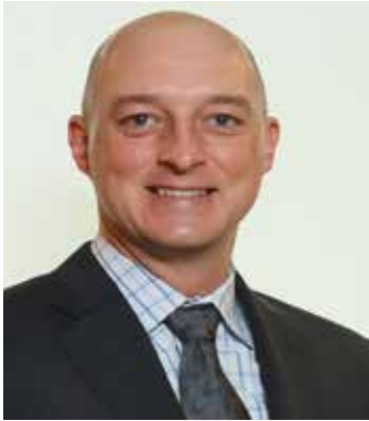
Commodore Troy Wieck