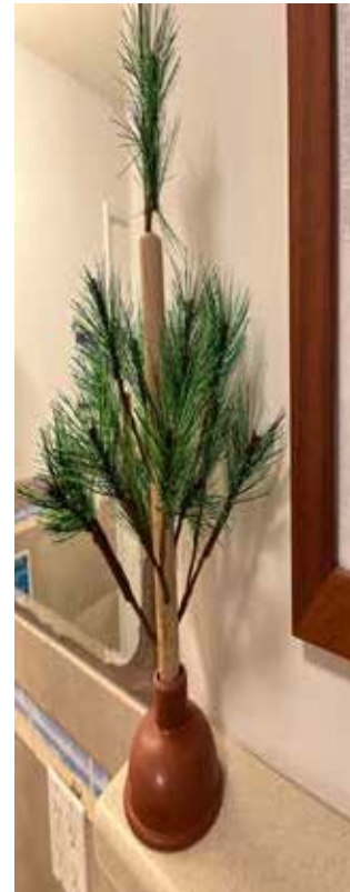
Unofficial tree found where only men could see it