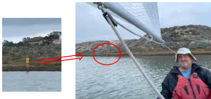
Figure 2 A & B: Captain Moe helms past the submarine cable crossings