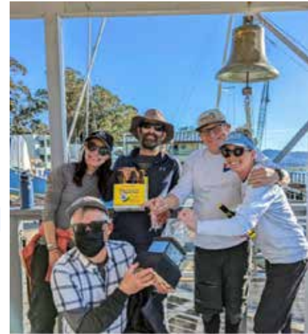
Winners of the Hangover