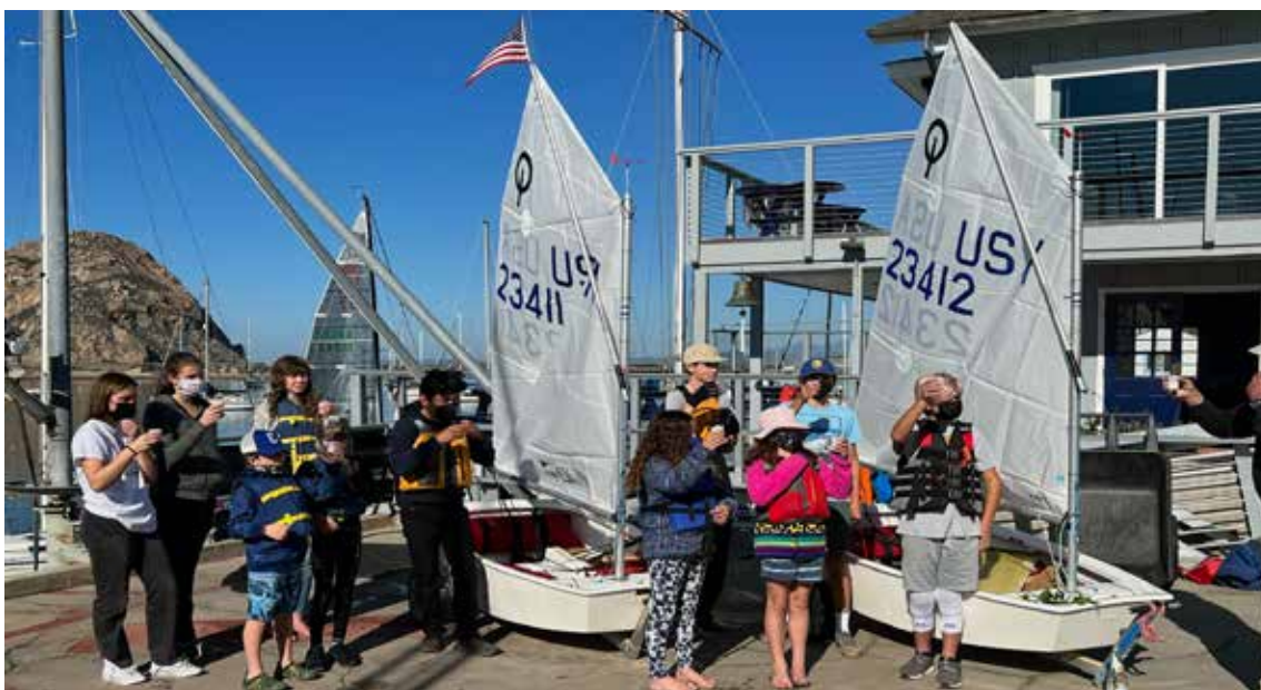
Juniors toast their new Optis