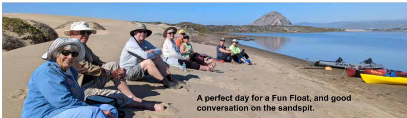
A perfect day for a Fun Float, and good conversation on the sandspit.

The second float this month was much, much nicer. Nearly still air, good currents, and blue skies made for an easy paddle and a most enjoyable FunFloat.