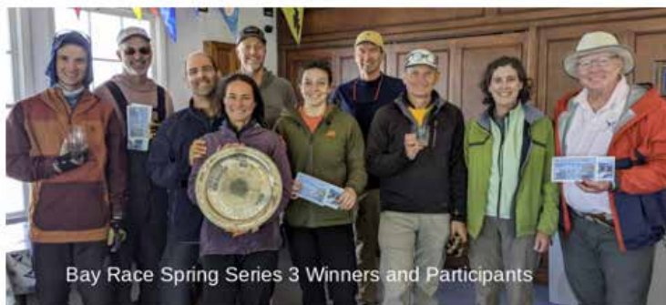
Bay Race Spring Series 3 Winners and Participants