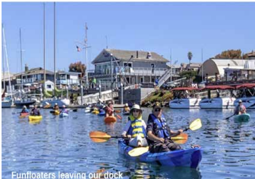
Funfloaters leaving our dock