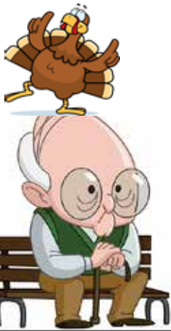
The Kurmudgeon Korner

Well, the Third Annual Kurmudgeon Klassic Regatta is in the history books. As of this reporting, we have not sorted out the sordid winners, so there is not much there to report. There was an unconfirmed news flash from the race safety boats. They said that they have to report that during the race there was a significant loss of life. Various