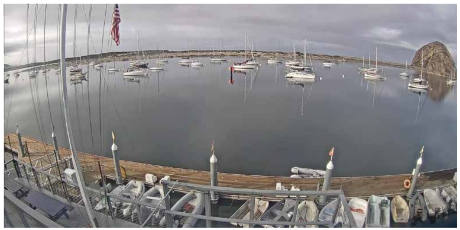
Calm before the storm