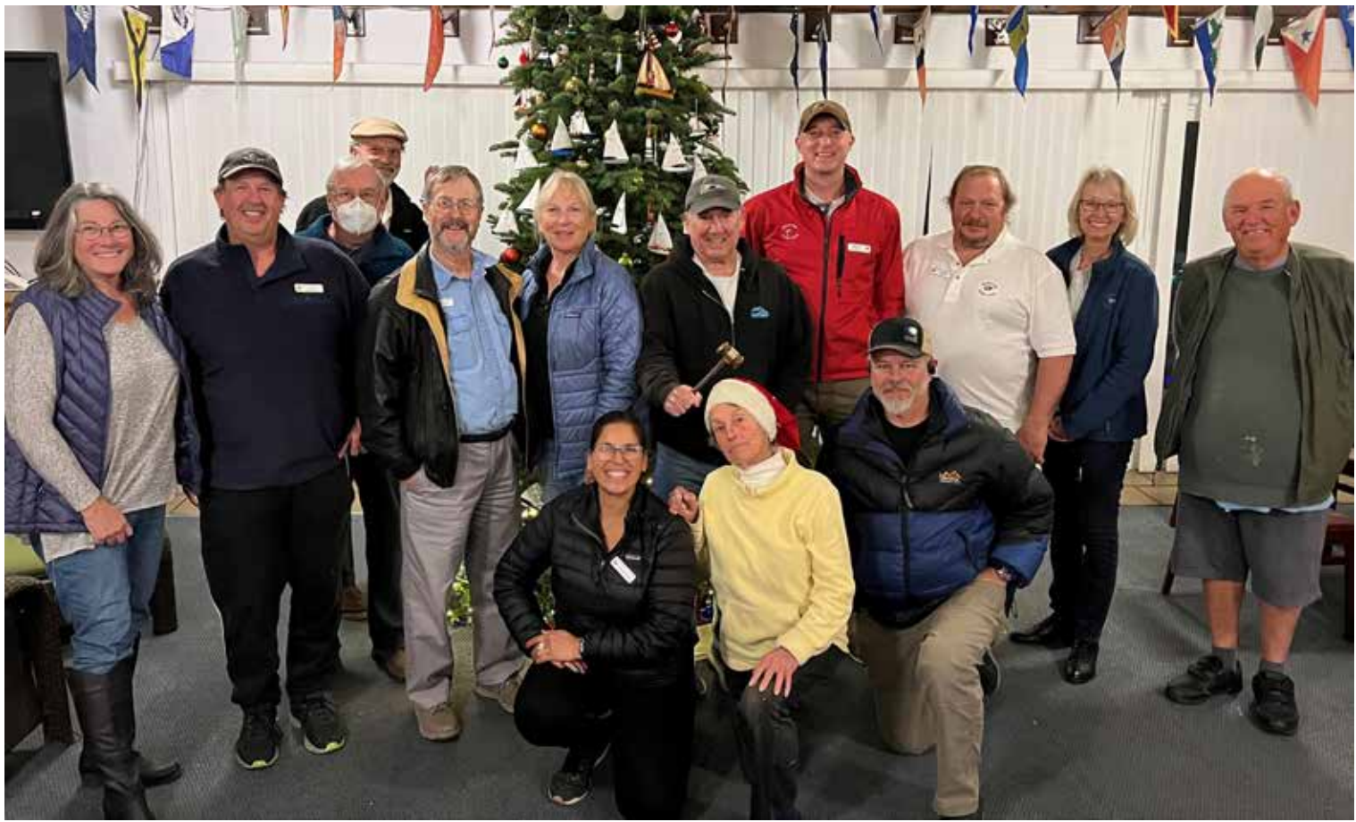
Club officers gather for holiday celebration

I am certain that somewhere in a back room at the Club that someone is conspiring to impeach me. So, I figure I had better keep the momentum going as I did as Vice Commodore by making the Club a better place. (Continued on following page)