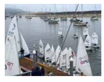
...The Junior membership expanded from 18 members on the reopening to the current membership of 43 with sailors ranging from 8 to 18 years old...