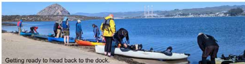
Getting ready to head back to the dock.

Fun Floats are held when we have a high tide around noon. That is about twice a month. They are posted on our club's website calendar and in the calendar in the Masthead. Anyone is welcome to participate. Participants need to have some kind of paddle craft, to be ready to depart the dock at 11 am, bring lunch and to be ready to enjoy some time on the water with friends.