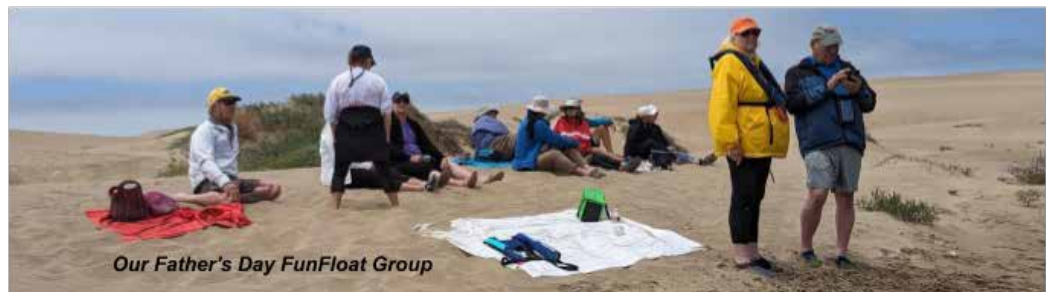
Our Father's Day FunFloat Group