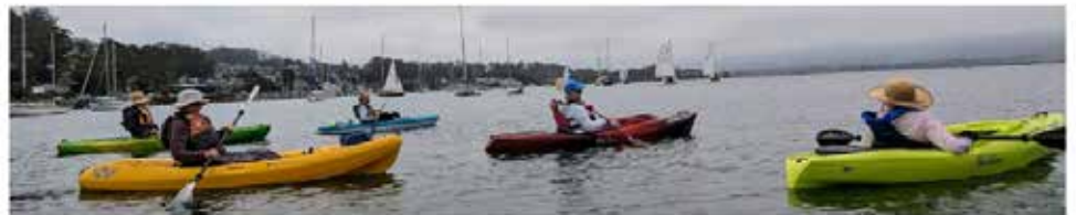
Passing the DaySailer Championship while headed into the bay.