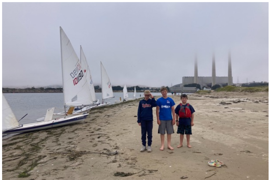
How do we 'stack' up?