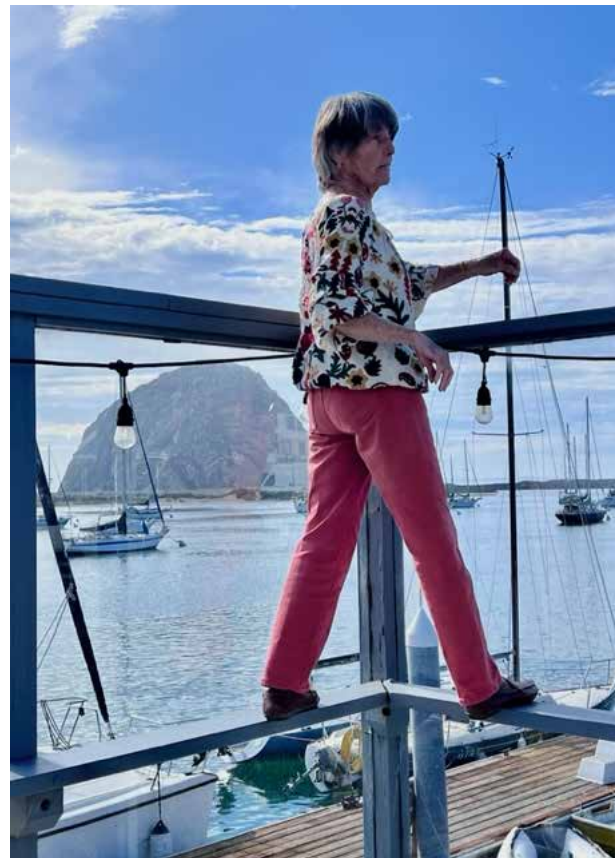
Captain on deck