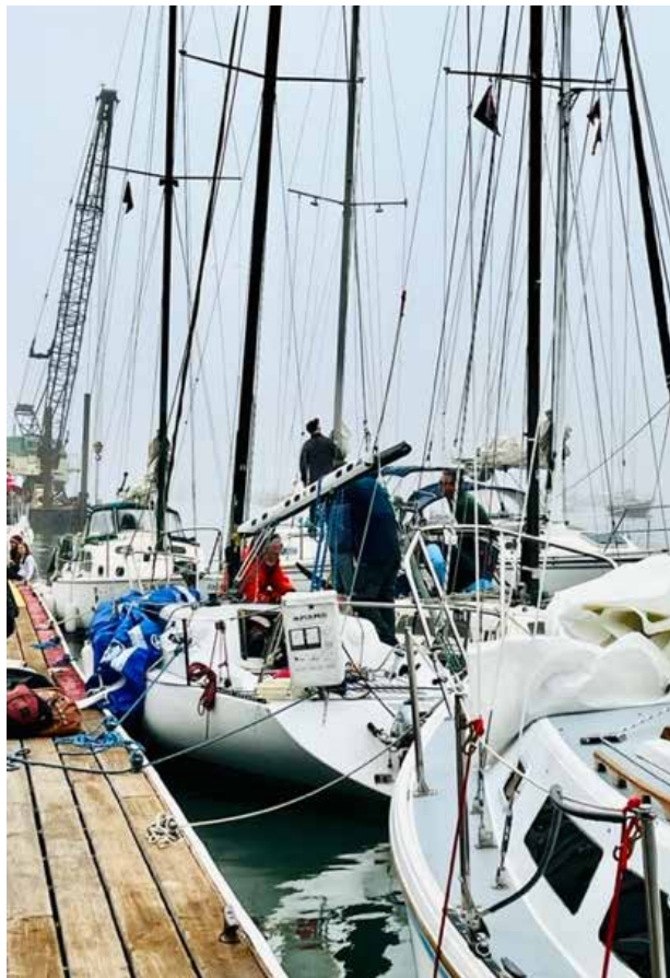
Laurie Wright-- Zongo at dock