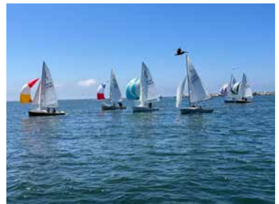
Don't look up