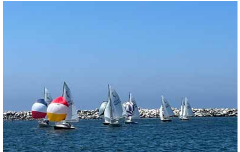
DS fleet captured coming and going