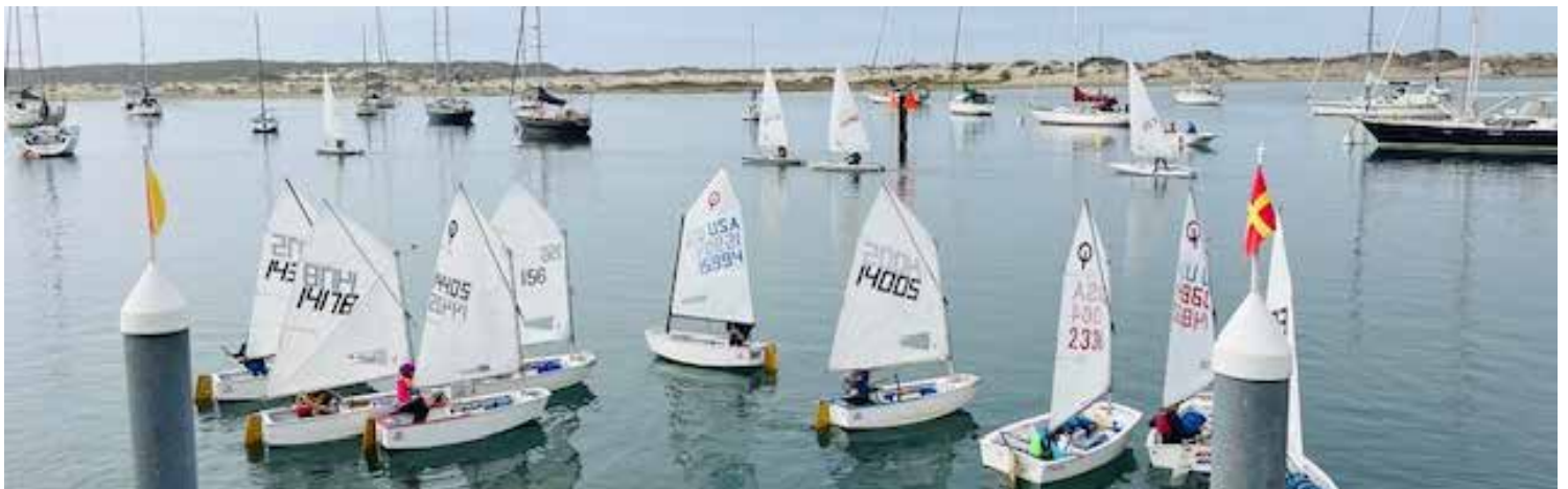
Laurie Wright Photos