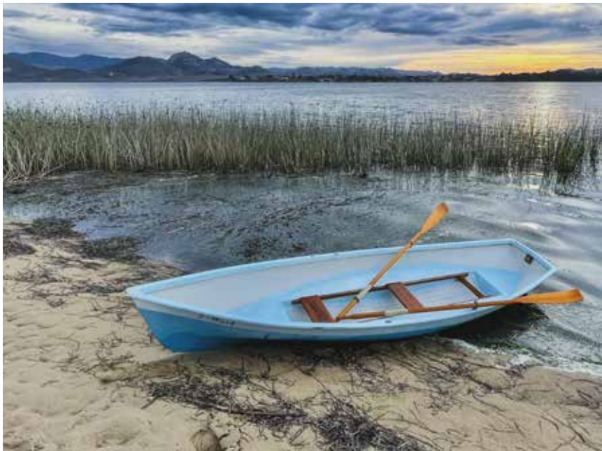
Paul Irving Photo