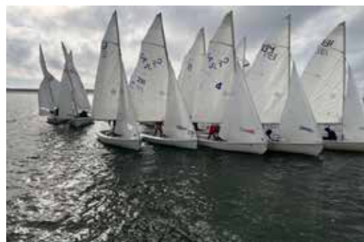
Figure 1: example Cluster Finish