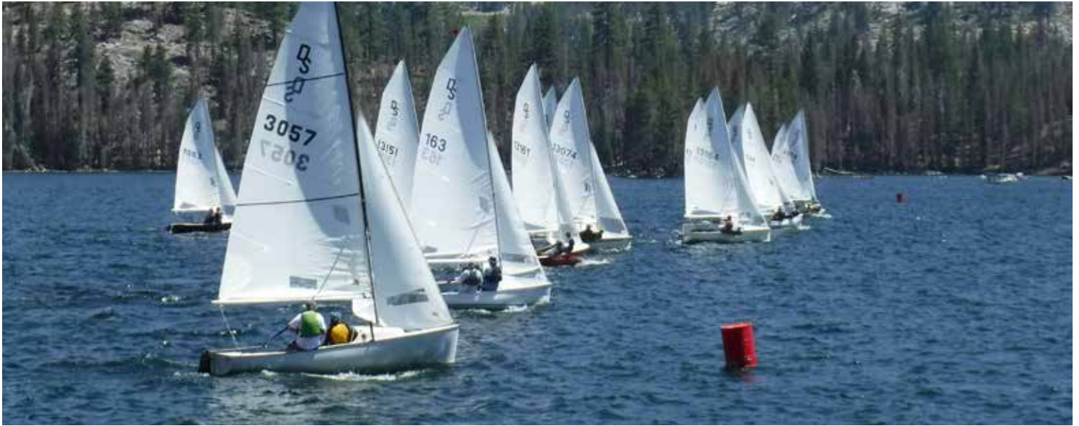
Starting line at Huntington Lake 2021