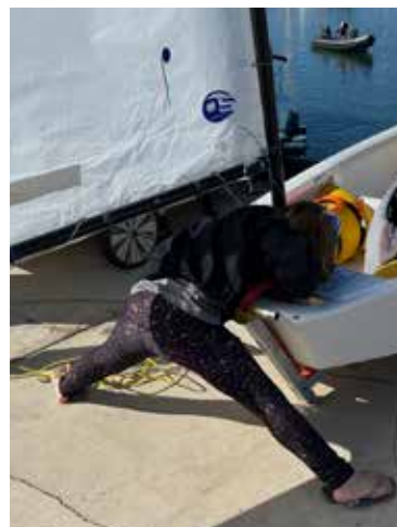
Whale D Hack Whale spout, St Patrick Day attire, resting sailor and Optis on deck M Buchman