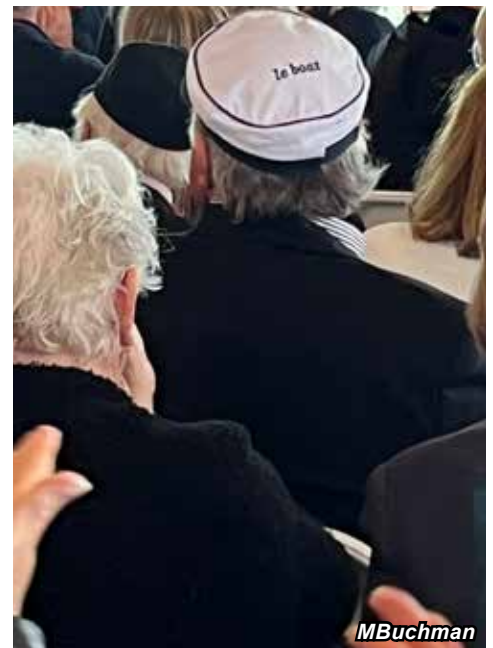
Opening Day