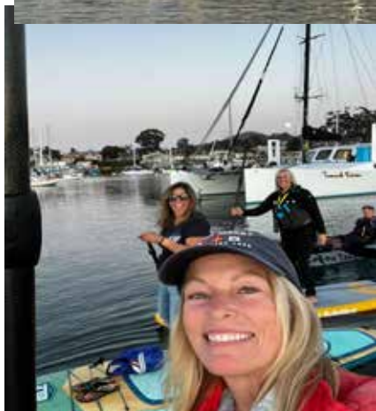
A few of us intrepid souls enjoyed a full moon-rise paddle Sept 16!