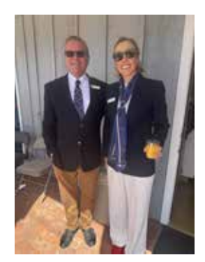
left, above