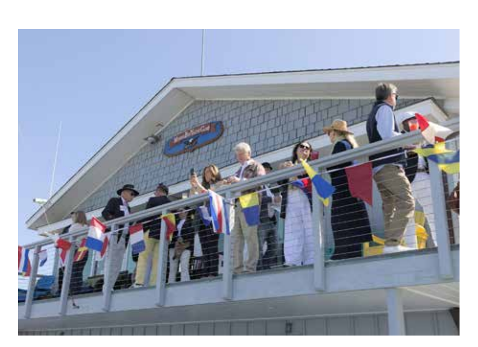
Opening Day on the deck.

Volunteers are always welcome and appreciated