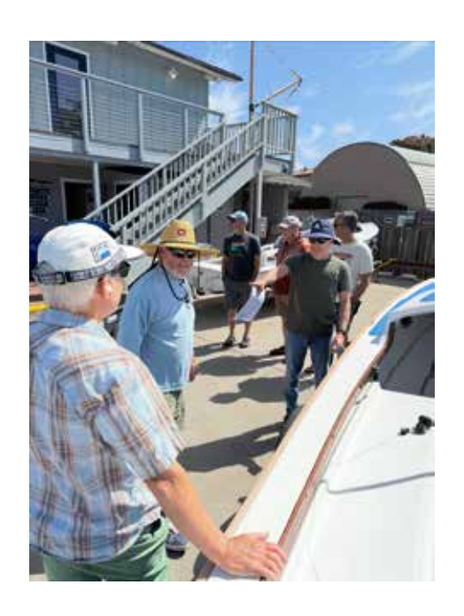
High Sierra and Day Sailer Regattas at Huntington Lake Weigh In and Measures