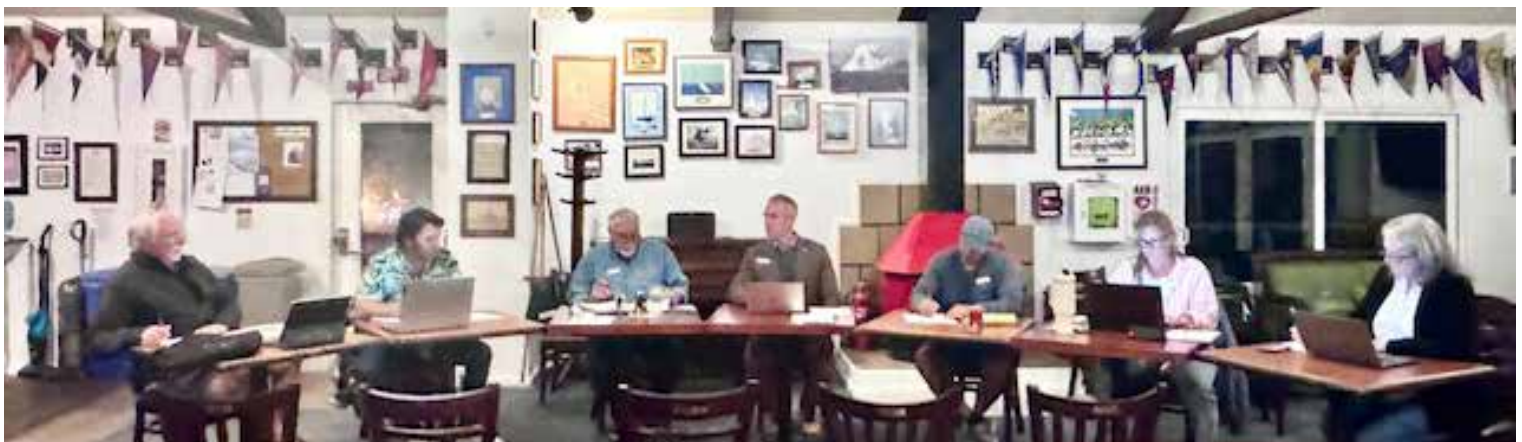
2015 Board of Directors hard at work